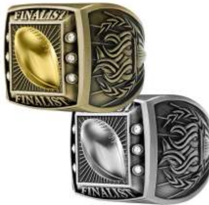
Stock Torch Series Starting at $21.95