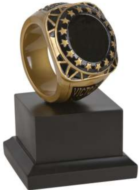
Championship Ring Award Resin RFC-883 5 1/2" $31.95 With Sublimated Plate