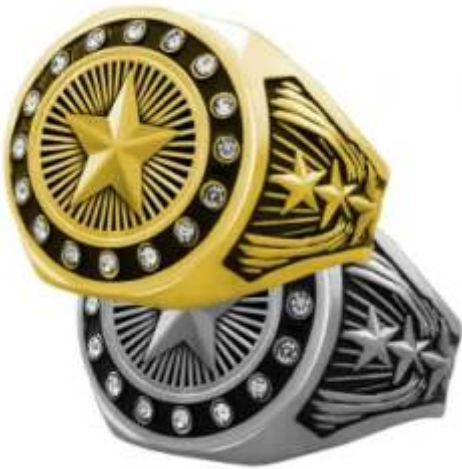
Stock Star Series Starting at $21.95