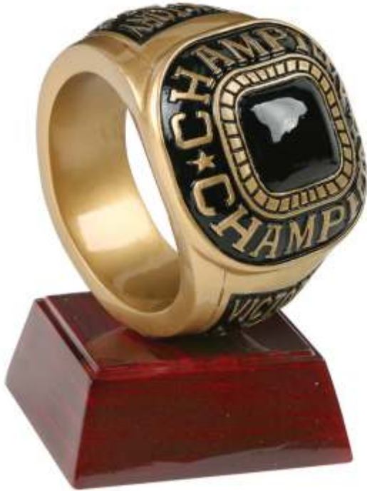
Championship Ring Award Resin RFC-400 4 1/2" $21.95 With Sublimated Plate